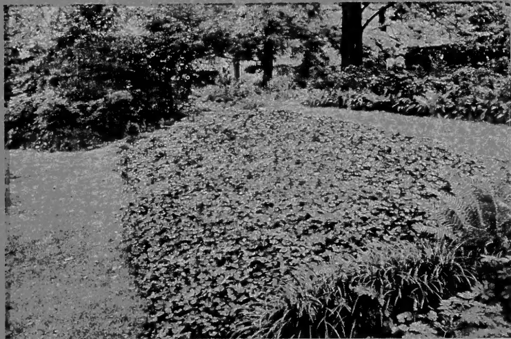
Just a gradual slope but Baltic Ivy does extremely well in this very sunny area. You can plant very steep banks with Baltic Ivy, Pachysandra, Myrtle, Euonymus.